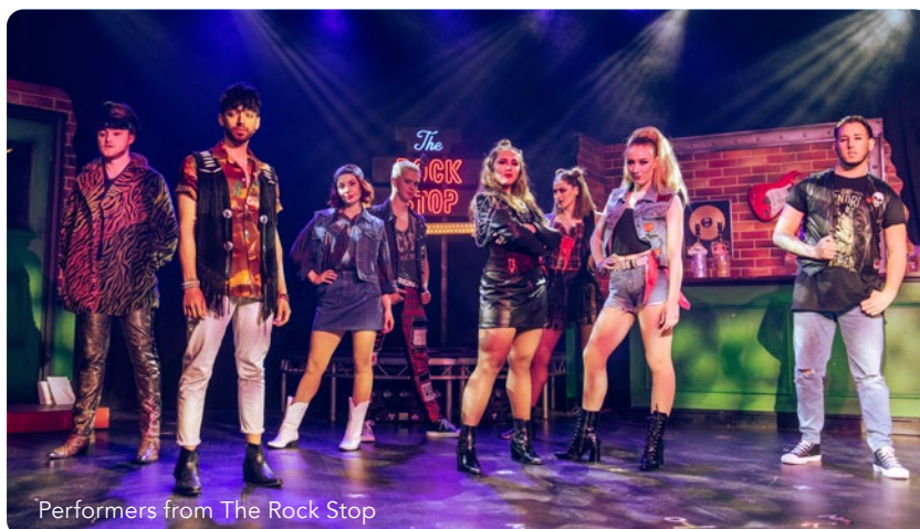
Performers from The Rock Stop

The impressive Hickstead Show Bar within The White Horse entertainment and leisure venue seats up to 1,250 people, so you can enjoy a variety of top-notch entertainment from big name stars, comedy acts, party bands and much more!