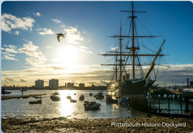
Portsmouth Historic Dockyard

Nautical Portsmouth is less than half an hour away, home to the Spinnaker Tower, Historic Dockyard, Blue Reef Aquarium and Gunwharf Quays for retail therapy with a view. Goodwood is great if you fancy a flutter, Chichester is a cultural must and cosmopolitan Brighton is just an hour away.