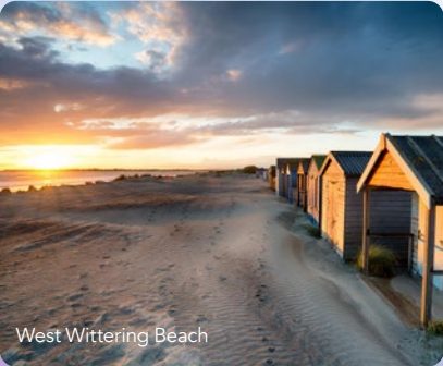
West Wittering Beach