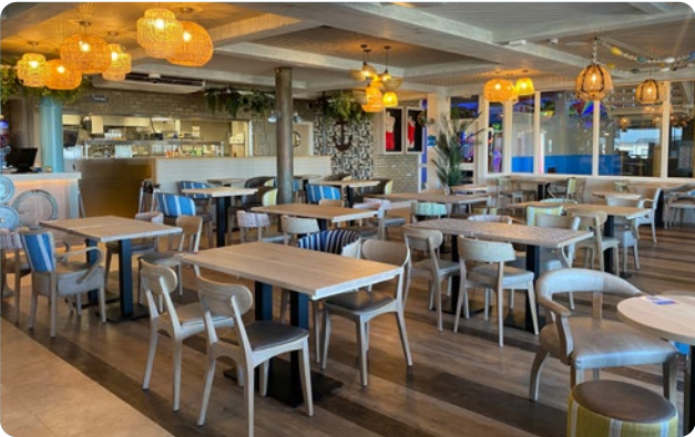
Smokey's Ocean Bar

Wherever you dine, we can promise delicious food, a great atmosphere and a truly warm welcome.